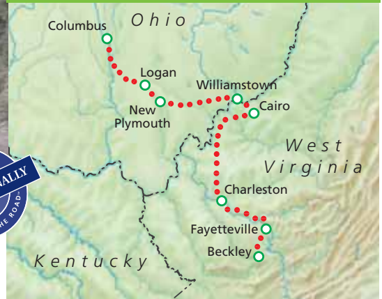
For full maps of Ohio and West Virginia, see pp. 78-81 and 112 of the Rand McNally 2006 Road Atlas.