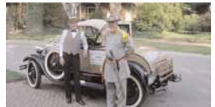
Homeowners in period dress pose in Parkersburg, WV.

Across the Ohio River, Parkersburg, West Virginia, wears its age well. At the Visitors Center, detailed brochures are available for a tour of the Julia-Ann Square Historic District. Though the 26-home tour is designated as walk-by, the proud homeowners sometimes invite curious passersby in for a peek into the renovations.