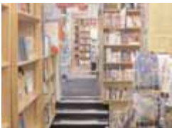
The Book Loft in Columbus, Ohio, features 32 rooms of books.

boutiques, upscale restaurants, pubs, and coffee shops like Cup O' Joe, a local hangout. Students from Ohio State and neighborhood residents browse through the 32 rooms of the Book Loft, an independent bookstore filled with books, music, and lots of crannies in which to read. Open six days a week, the Visitor's Center at the Meeting Haus offers tours of the neighborhood with advance notice.