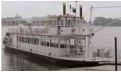
A ferry shuttles visitors to Blennerhasset Island State Park in West Virginia.

Near the Oil and Gas Museum, the Blennerhasset Museum of Regional History sells tickets to Blennerhasset Island State Park. The island, purchased in 1798 by wealthy Irish immigrants Harmon and Margaret Blennerhasset, can be accessed via a paddlewheel boat in summer.