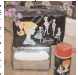
Barbie is just part of the extensive collection at Etta's Lunchbox Café, New Plymouth, Ohio.

En route east towards West Virginia, Etta's Lunchbox serves up more than pizza and sandwiches. The walls and ceiling of this café and general store are covered with owner Ledora Ousley's collection of lunchboxes dating from the 1940s. Find your favorite lunchbox from your schooldays and Ousley usually makes a spot-on guess of your age. "First I had 20, then 50. Now I have 800," Ousley says, though not all are on display.