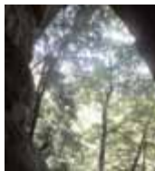
A rock formation frames the forest at Hocking Hills State Park, Ohio.

South of Columbus, the drive quickly passes into farmland and wooded areas. In the Hocking Hills, lodging options range from simple campsites and motels to cabins at upscale resorts like Glenlaurel Inn and Inn at Cedar Falls. Dinner at the Scottish-style Glenlaurel Inn is a five-course affair for $49 plus tax and tip. Entrees vary, but may include filet mignon, salmon, or rack of lamb, served in the castle-motif dining room.