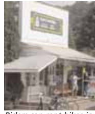
Riders can rent bikes in Cairo, WV for a rail trail trip through old train tunnels.

Half an hour east of Parkersburg in Cairo, just off US 50, the 72-mile North Bend Rail Trail includes thirteen tunnels for bikers to pass through, including one purported to be haunted. Country Trails Bikes , just off