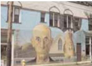
A mural in Columbus, Ohio's Short North district riffs Grant Wood's American Gothic.

Columbus wraps some of its best treasures right near the heart of downtown. A few blocks from the city core, German Village hums with activity. Built in the 1860s by German immigrants, the trendy neighborhood is one of the nation's oldest historic districts. The sturdy brick streets are lined with