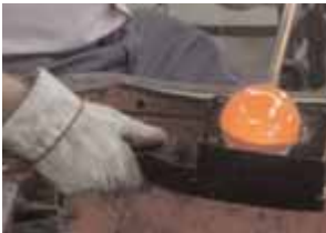
A craftsman molds hot glass at Fenton Art Glass in Williamstown, WV.

Upriver in Williamstown, Fenton Art Glass remains one of the last of a long line of glass operations in West Virginia. It is still owned by the Fenton family, which founded it in 1905. Up to eight factory tours a day and an