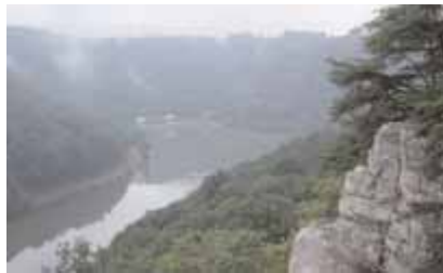
Lover's Leap lookout is a favorite vista at Hawks Nest State Park, in West Virginia.

Interstate 77 heads straight through Charleston and into Beckley and the New River Gorge area. But a more scenic route jogs east on US 60 along the Midland Trail. A platform at Hawks Nest State Park, in Ansted, overlooks the New River. Here, an aerial tram brings park guests to New River Jetboats for a 30-minute wet and wild ride upstream to the New River Gorge Bridge towering 876 feet above.