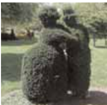
Topiary couple in Columbus, Ohio, represents Seurat's La Grande Jatte .

To the east of downtown, on the corner of East Town and Washington, the Topiary Garden at Old Deaf School Park recreates in topiary Georges Seurat's painting A Sunday on La Grande Jatte . There are 50 living sculptures of people, boats, and animals — some 12 feet high — in the nine-acre park.